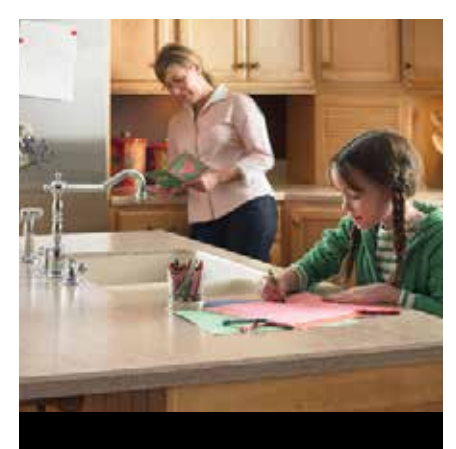
A KEY TO KEEPING YOUR COUNTERTOPS LOOKING GOOD IS TO THOROUGHLY RINSE AND WIPE COMPLETELY DRY AFTER CLEANING.

* Contact your local authorized DuPont<sup>™</sup> Corian<sup>®</sup> retailer or DuPont<sup>™</sup> Corian<sup>®</sup> Certified Fabricator Installer if you are uncertain what type of finish is on your countertop.